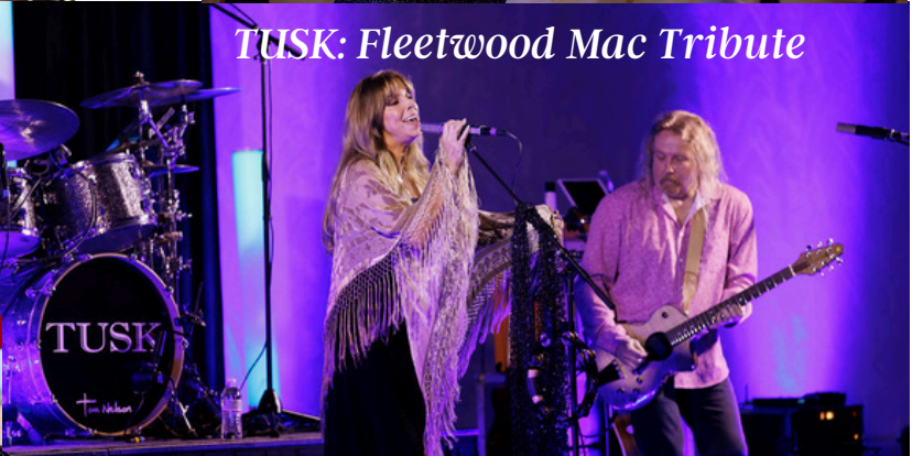
TUSK: Fleetwood Mac Tribute